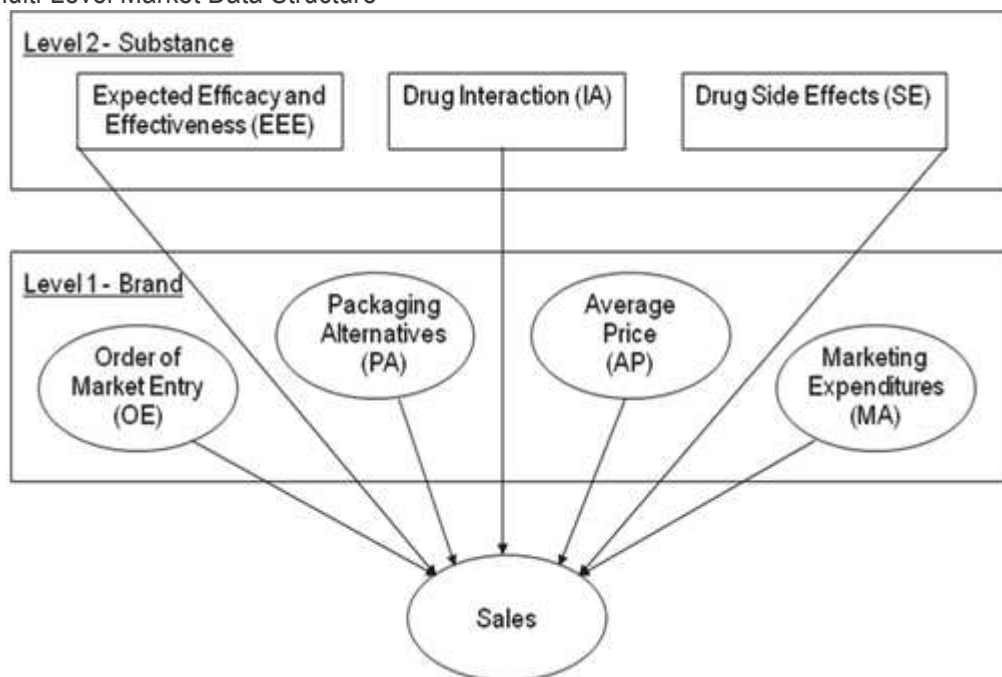
Fig. 1: Multi-Level Market Data Structure

Furthermore, taking into consideration that some of the brands use the same substance (multiple brands can use the same substance, e.g. Paracetamol), a hierarchical two-level data structure is suggested, indicating a brand (first) and a substance (second) level. The substance level includes EEE, IA, and SE variables. The brand level, on the other hand, contains OE, packaging alternatives (PA), average price (AP) and MA as independent variables, whereas average sales (AS) results in a dependent variable (see Figure 1).